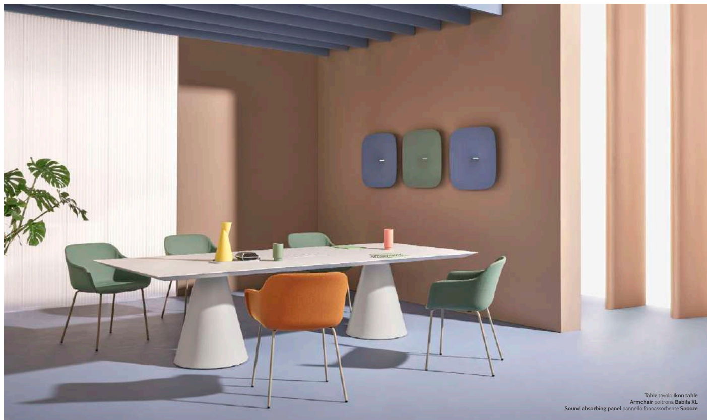
Table tavolo Ikon table Armchair poltrona Babila XL Sound absorbing panel pannello fonoassorbente Snooze