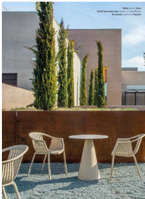
Table tavolo ikon Solid laminate top ripiano in stratificato Armchair poltrona Tatami