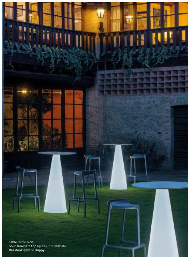
Table tavolo ikon Solid laminate top ripiano in stratificato Barstool sgabello Happy