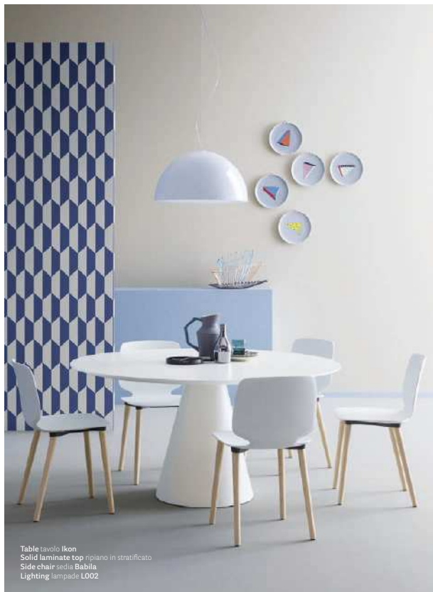
Table tavolo Ikon Solid laminate top ripiano in stratificato Side chair sedia Babila Lighting lampade L002