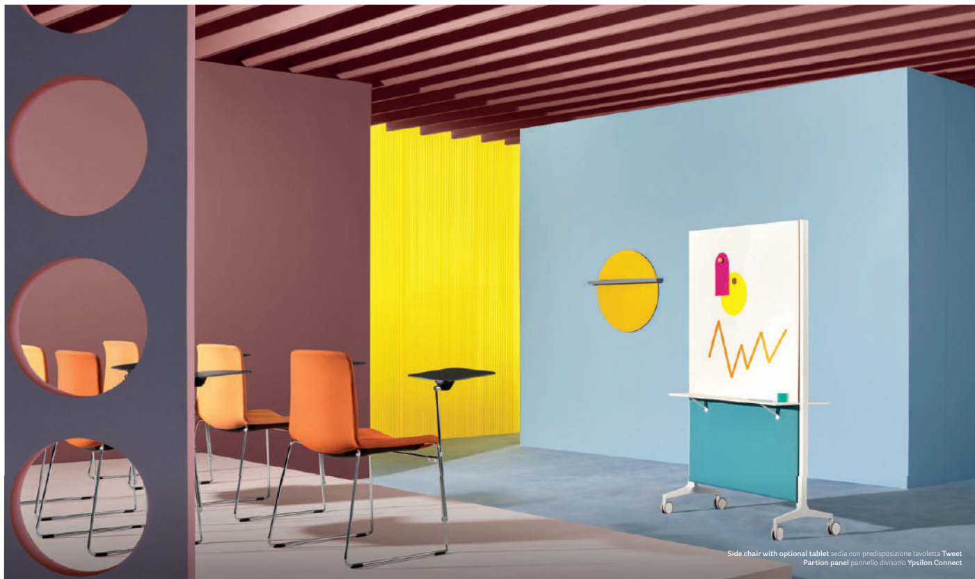
Side chair with optional tablet sedia con predisposizione tavoletta Tweet Partition panel pannello divisorio Ypsilon Connect