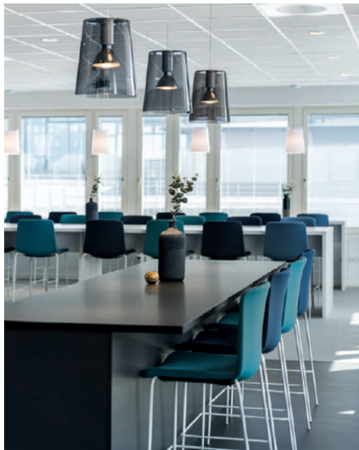
Seating / Sedute

Products: Tweet barstool and side chair, L001 lighting, Log lounge armchair and pouf, Social Plus modular seating