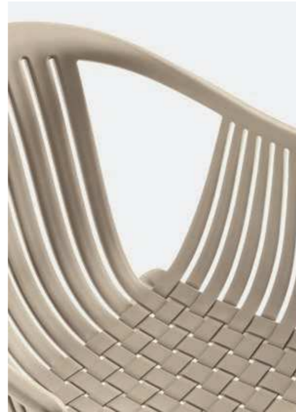
Gas air moulding polypropylene, 100% recyclable Polipropilene stampato con il supporto del gas, 100% riciclabile