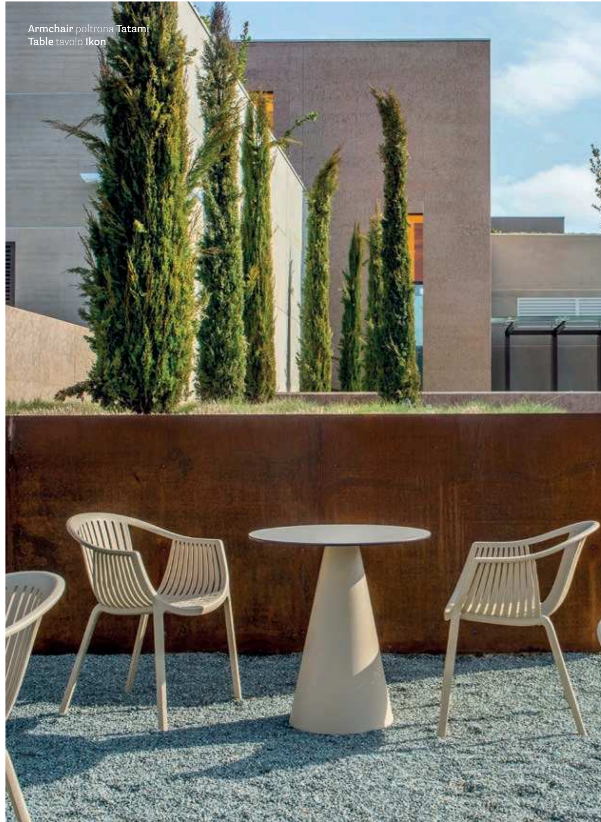
Armchair poltrona Tatami Table tavolo Ikon