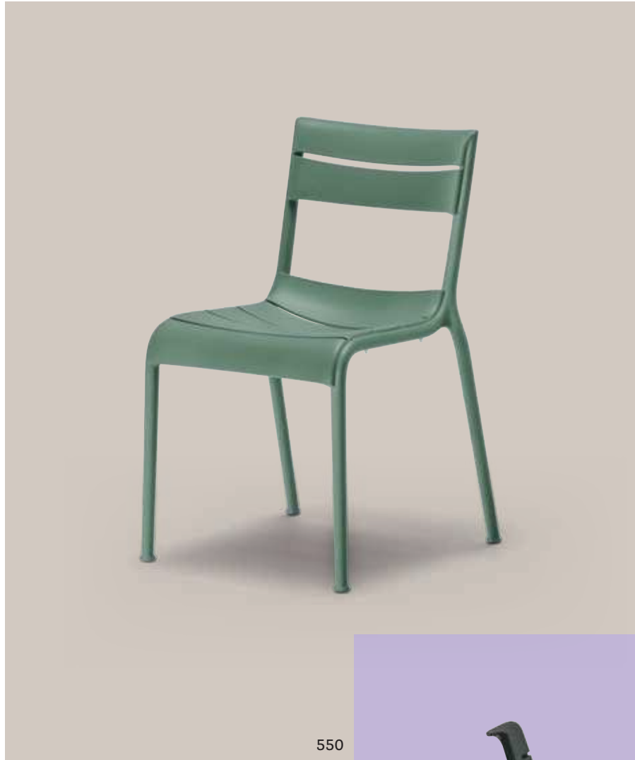
SIDE CHAIR — ARMCHAIR