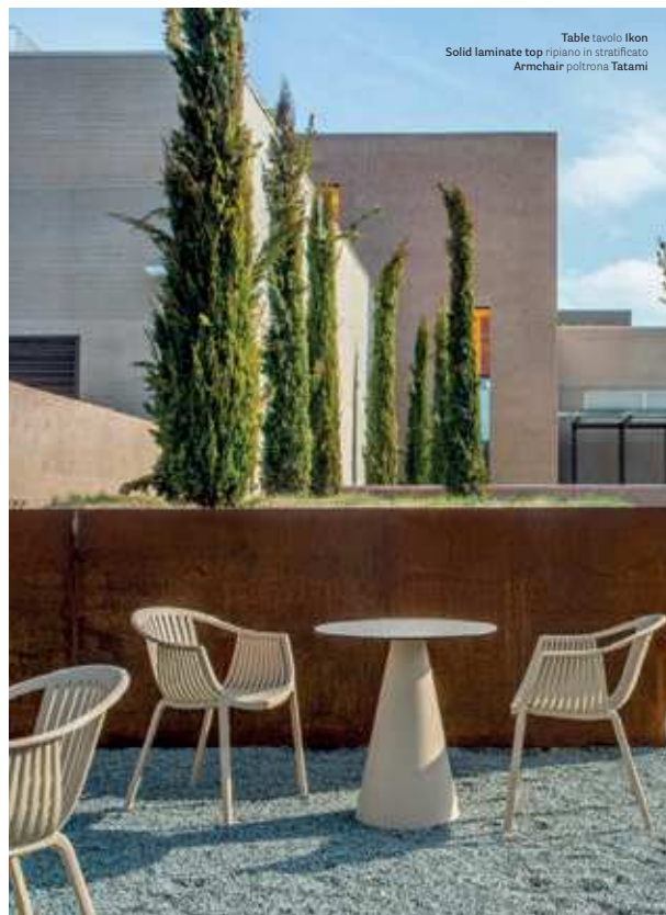
Table tavolo ikon Solid laminate top ripiano in stratificato Armchair poltrona Tatami