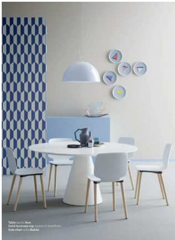
Table tavolo Ikon Solid laminate top ripiano in stratificato Side chair sedia Babila