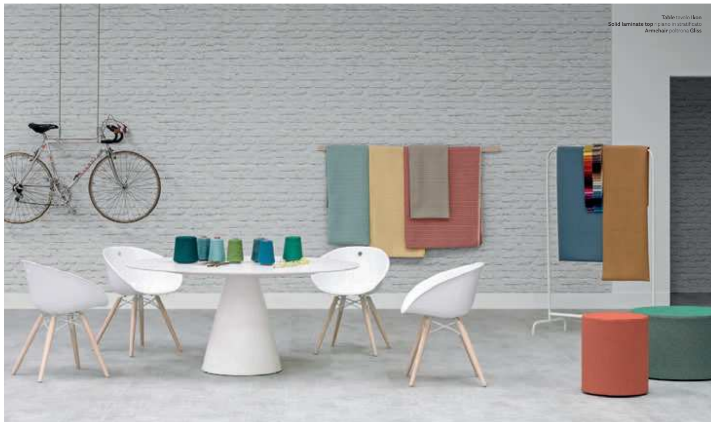
Table tavolo ikon Solid laminate top ripiano in stratificato Armchair poltrona Gliss