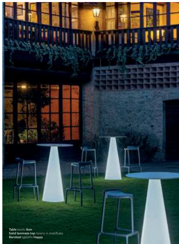
Table tavolo ikon Solid laminate top ripiano in stratificato Barstool sgabello Happy