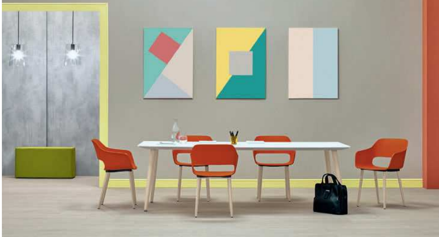
Armchair poltrona Babila