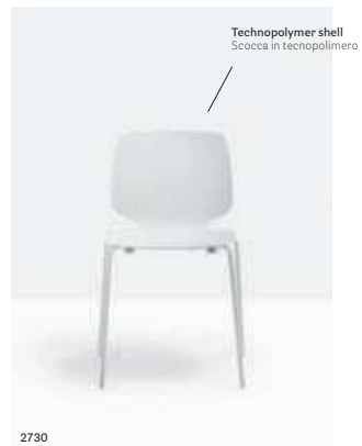
Technopolymer shell Scocca in tecnopolimero