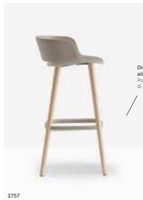
Die-cast aluminium footrest Poggiapiedi in pressofusione di alluminio