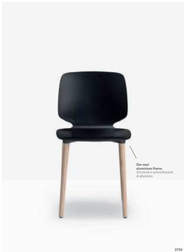
Die-cast aluminium frame Struttura in pressofusione di alluminio