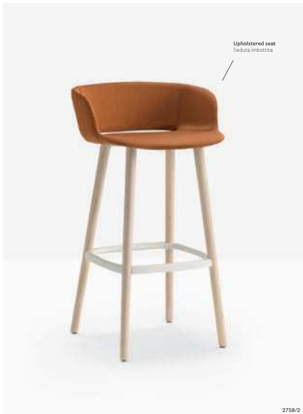
Upholstered seat Seduta imbottita