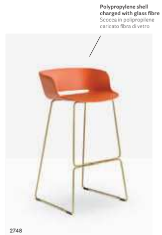
Polypropylene shell charged with glass fibre Scocca in polipropilene caricato fibra di vetro