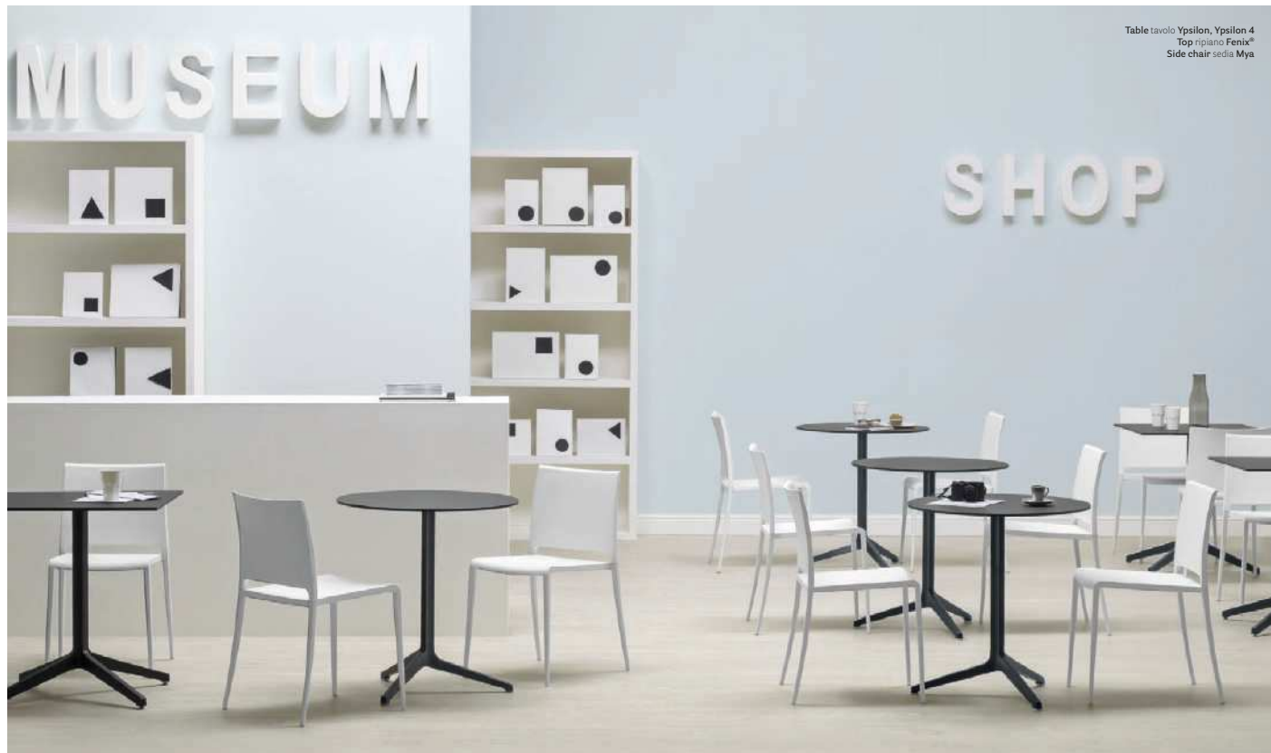
Table tavolo Ypsilon, Ypsilon 4 Top ripiano Fenix® Side chair sedia Mya