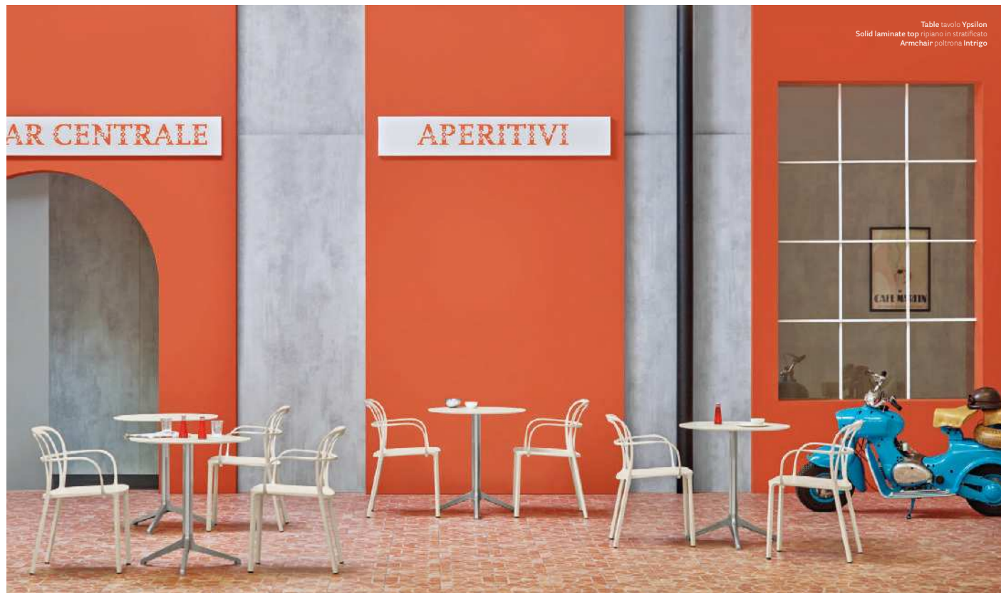
Table tavolo Ypsilon Solid laminate top ripiano in stratificato Armchair poltrona Intrigo