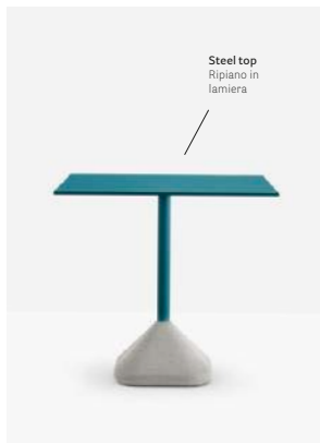
Steel top Ripiano in lamiera