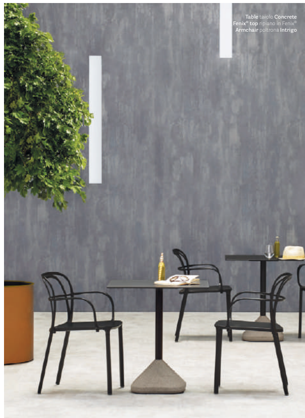
Table tavolo Concrete Fenix® top ripiano in Fenix® Armchair poltrona Intrigo