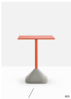
Rubber feet Piedini in gomma