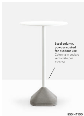
Steel column, powder coated for outdoor use Colonna in acciaio verniciato per esterno