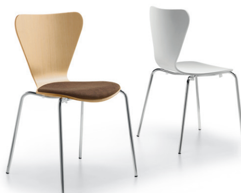
S160L schienale triangolare triangular backrest