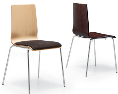
S160L schienale squadrato squared backrest